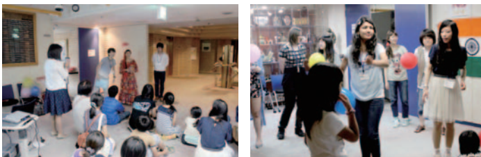
Exchange programs held in the salon.