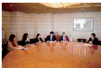
Special Conference Room