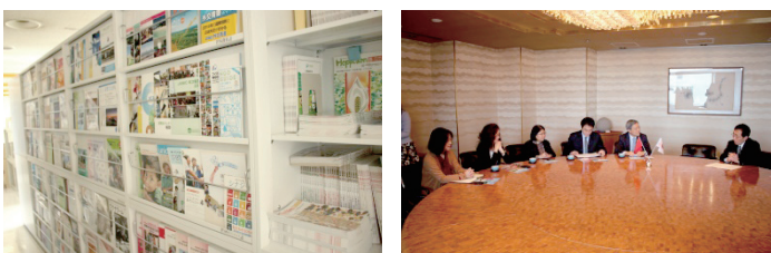
Display of periodicals issued by international exchange organizations