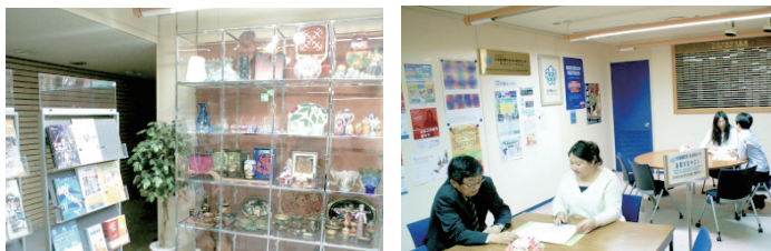
International Exchange Salon

Membership applications are accepted on the website, FAX and Email. Download the application on the "Membership Information" page on our website ( http://www.hiecc.or.jp ).